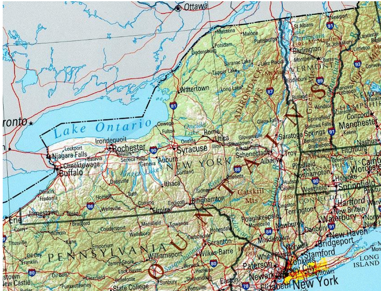
Map I: New York State

This map is available online through the University of Texas at Austin's Perry-Castaneda Library map collection: http://www.lib.utexas.edu/maps/us_2001/new_york_ref_2001.jpg .